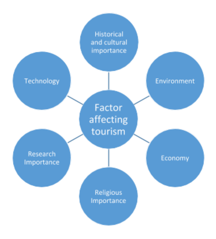
Fig: 3. Shows the Factor Affecting Tourism

(Source: Tourism - Sustained Development and Management by S. Das et. al 2012)